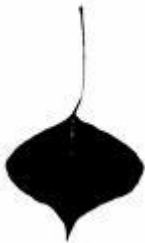
Chinese Tallow Leaf